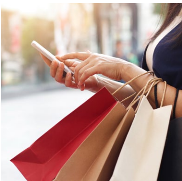
Great discounts on merchandise online