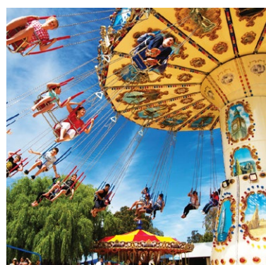
Theme Parks & Attractions