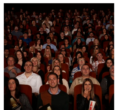
Discounted Movie Tickets

To join please fill out the application form on page 2 and email it to: nab.store.membership@nab.com.au