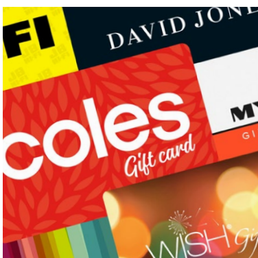
Discounted Gift Cards