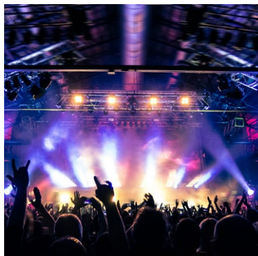
Concert & Theatre Tickets